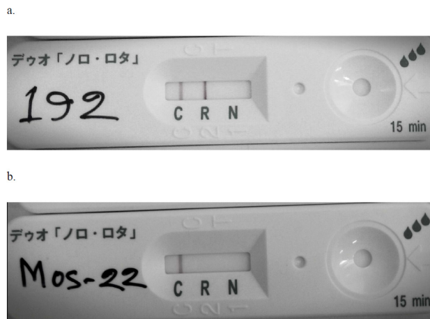
Figure 1. Detection method of the IP-Rota/Noro kit. The test is positive if two lines appear in the membrane (a). The test is negative when only one line appears in the control area (b).

Sensitivity for IC kit = \frac{\text{Both IC kit and RT-PCR Positive}}{\text{RT-PCR positive}} \times 100